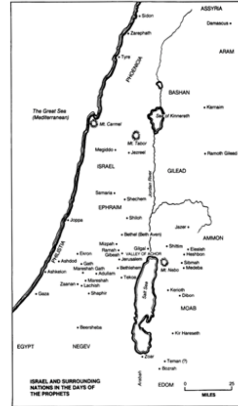
Cities in Micah 1